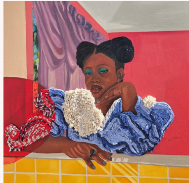
View from the Balcony, 2024 - Serenity: State of Calmness, 2025 - Solace, 2024 - Breath Focus: Disengaging the Mind from Stress, 2025 Oil and mopping wool fiber on canvas, Different sizes