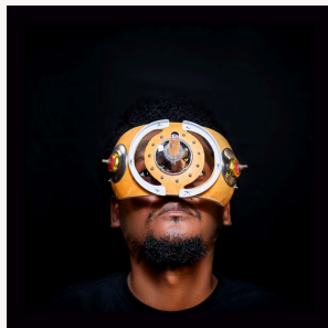
Grey Hair, 2025 Istanbul Sun, 2025 Zawadi (Trophy), 2025 Pot, 2025 Pure Manjano, 2025

Scrap metal and recycled materials Different sizes