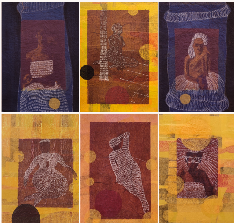
Ija, 2025 - Star Child, 2025 - Apolon, 2025 - Ajok, 2025 - Remembered Ideke, 2025 - Lakeri, 2025 Paper, pen, watercolour pencil and acrylics on cardboard 31 x 22 cm